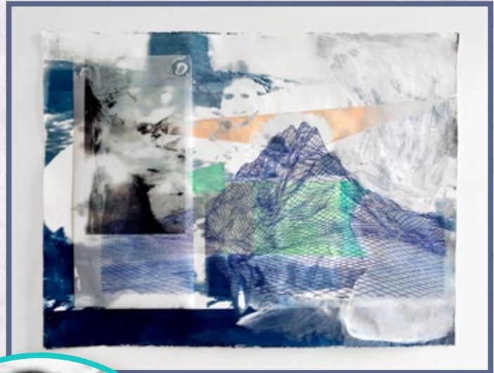
THE RIDGE, 2020. CYANOTYPE, COLOR PENCIL AND INK ON PAPER. 22 X 30 INCHES.