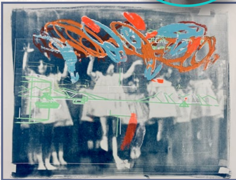
STUDY FOR PURI 2019. CYANOTYPE AND SILKSCREEN ON PAPER. 22 X 30 INCHES, EDITION OF 3.

Noroozi uses images of environmental catastrophes and forces of nature, such as floods or an erupting volcano, and borrows graphic elements of early arcade computer games to ask questions about the meaning of home, uncertainty of life, trauma and displacement.