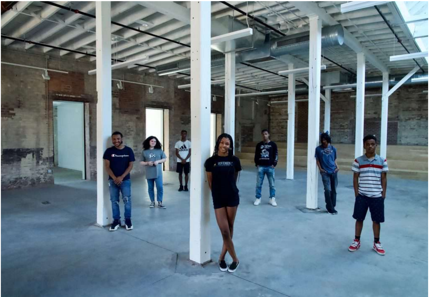
2020 NXTHVN High School Apprentices.