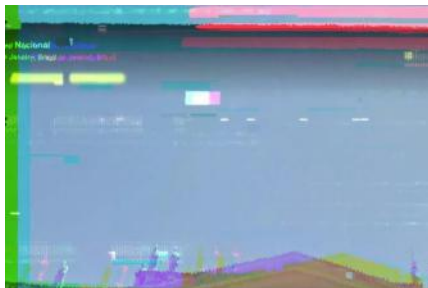
Ofri Cnaani, Leaking Lands, 2020, Film still.