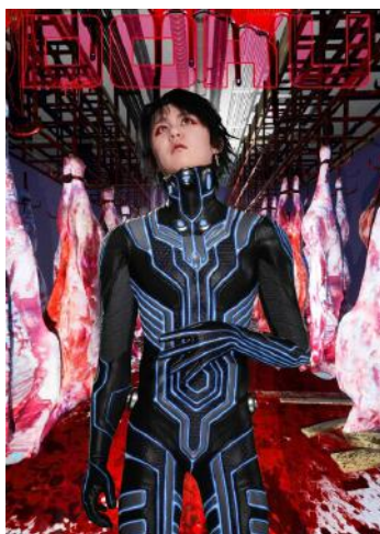
Lu Yang, Animal Realm #1, 2021, Aluminum, LED lights, backlit fabric. Courtesy the artist.