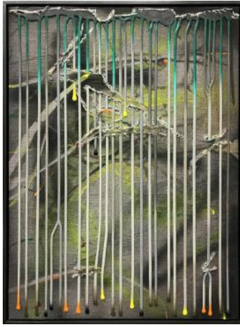
Paul Wesenberg, Untitled XII / Miracle Pictures, 2021, Oil on canvas, unprimed linen, oilskins, painted, varnished papier mâché.