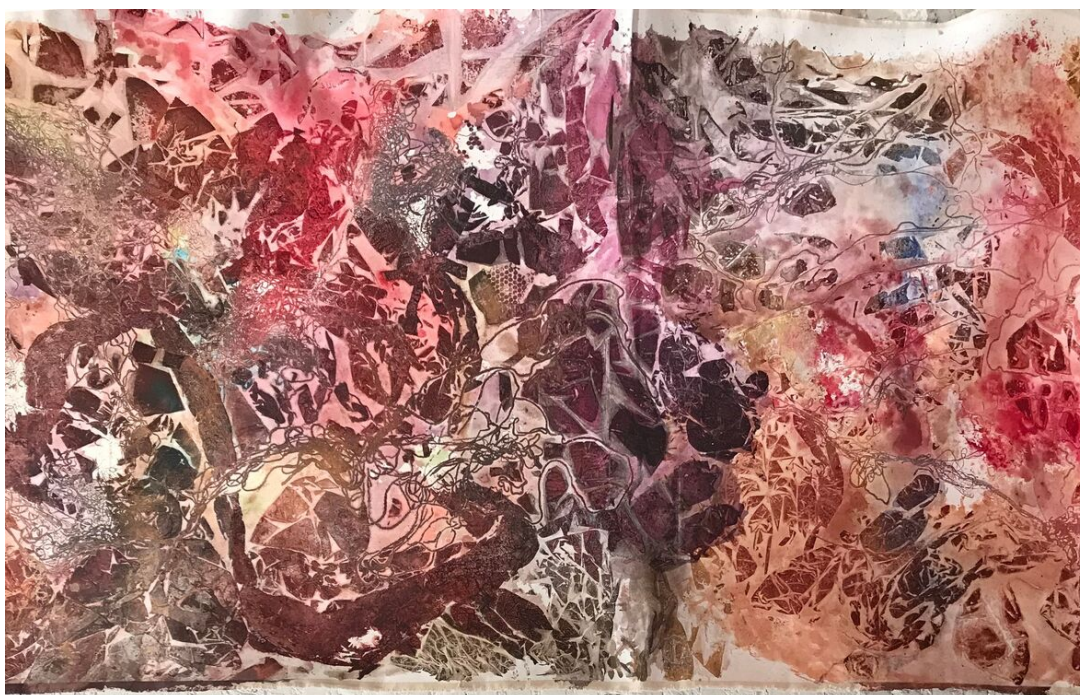
Rotem Reshef, Scroll of Perseverance, 2018, 60x681 in | 1.52x17.3 m (152x1730cm).