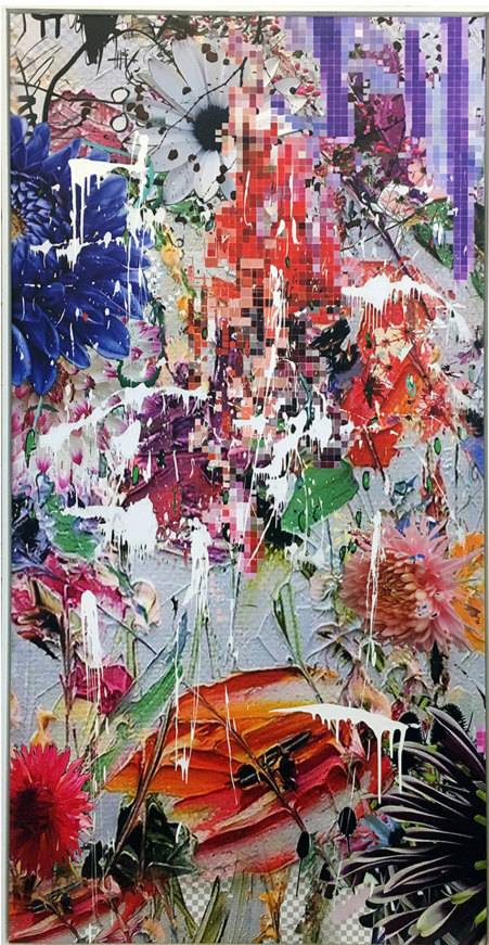
Irene Mamiye, Homage 2020 , pigment print and acrylic on canvas.