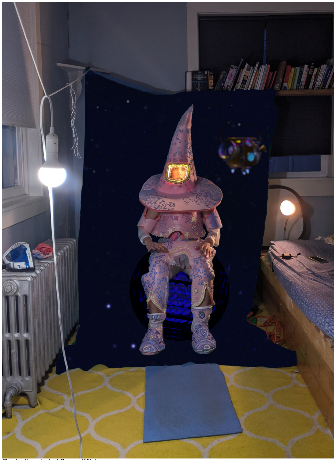
Production shot of Space Witches