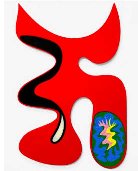
CARLOS ROSALES-SILVA, DIABLO EN EL JARDIN , 2019

Don't miss Carlos Rosales-Silva's first solo show at Ruiz-Healy Art. Titled " Sunland Park ," the artist is showing works from 2019-2021 and has painted a site specific mural that look at "the consistent influence of the landscape and architecture and artists that I grew up with along the border of Texas, Mexico, and El Paso. I'm constantly looking back at the landscape, looking back at the architecture." On view until 03/27, 2021. Carlos participated in the 2020 NYC-Based Artist Residency Program .