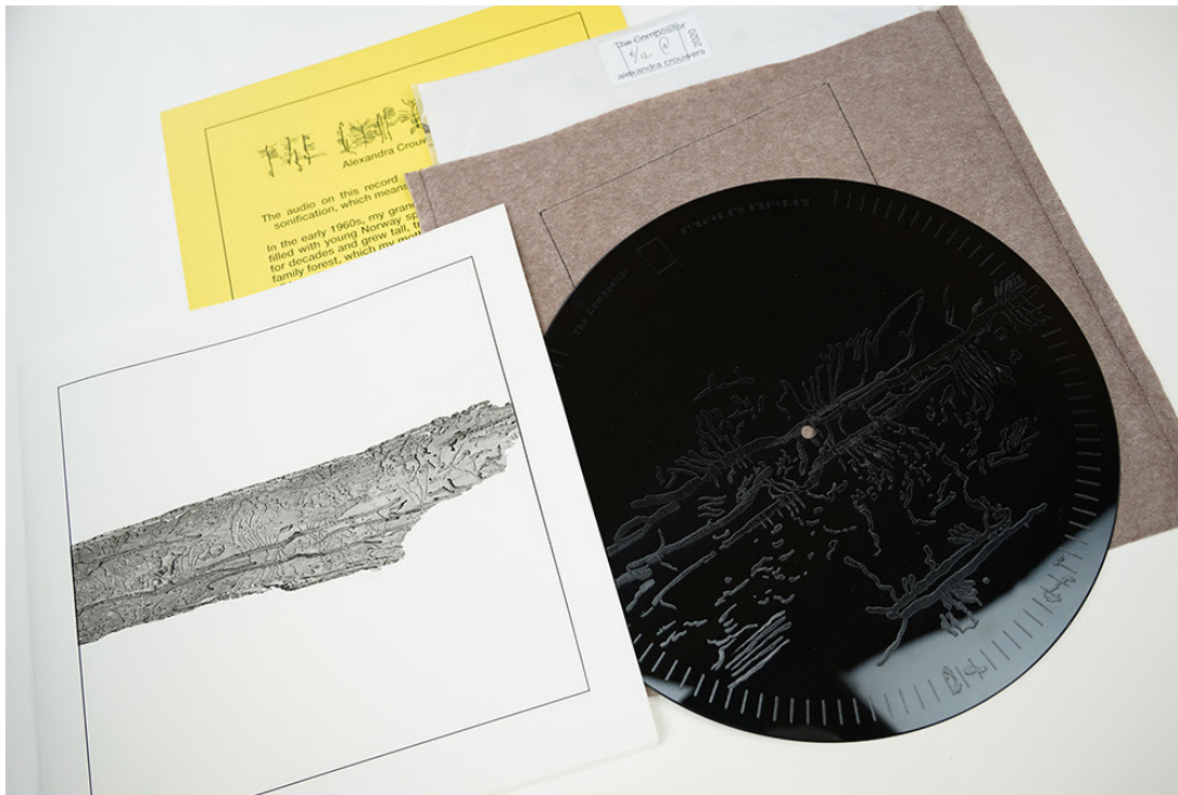
Signed and numbered 12-inch, engraved 180-gram vinyl record, sewn felt sleeve, folded poster and inlay.

Check out a virtual presentation of RU alumna Alexandra Crouws' (2020, Belgium/Netherlands) project The Compositor , an audio piece made using the method of sonification to transform the intricate tunnel patterns of Spruce Tree bark beetles that resemble alien alphabets or hieroglyphs, into sound. Learn more here .