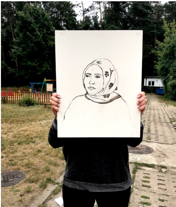
Asia Sztencel, You Can't Carry Your Landscape With You - Sister Project, 2019.