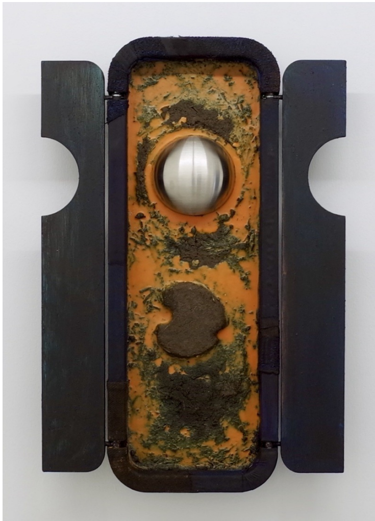
Bridges (blue), 2020, Beeswax, textile debris, soil, stainless steel, acrylic on wood.

Tooth of a Giant , a solo exhibition of work by RU alum Pedro Wirz (2014, Brazil) opened November 24 at Galerie Philipzllinger in Zurich, Switzerland. The exhibition features new sculptures, wall-objects, and drawings that reference cultural history, science, craft, and folklore with a focus on the modulation of planetary life. The exhibition is on view through January 16, 2021.