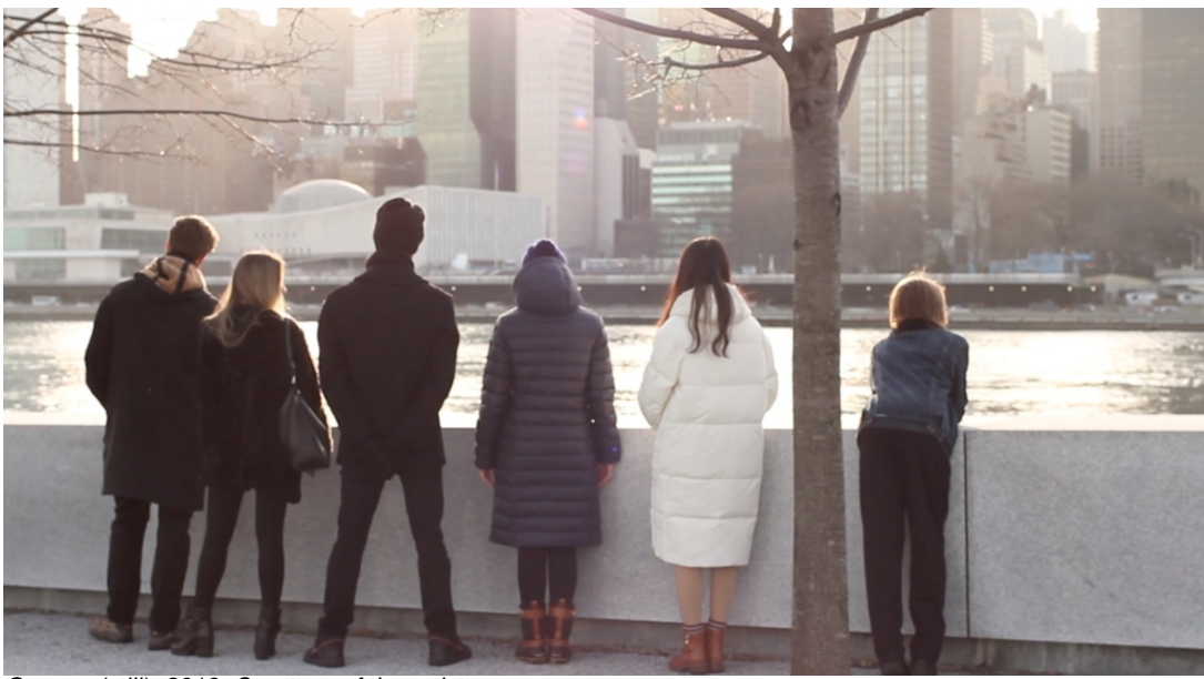
Oceans (still), 2019.

Oceans, produced by RU alumna Graciela Cassel (2016, Argentina) and Edgardo Parada has been nominated for Best Original Screenplay for a short film by The World Independent Cinema Awards 2021. Oceans was inspired by Rachel Carson's 1951 book The Sea Around Us and revolves around a group of teenagers who walk across Four Freedoms State Park on Roosevelt Island and interpret the ocean in different languages. View a