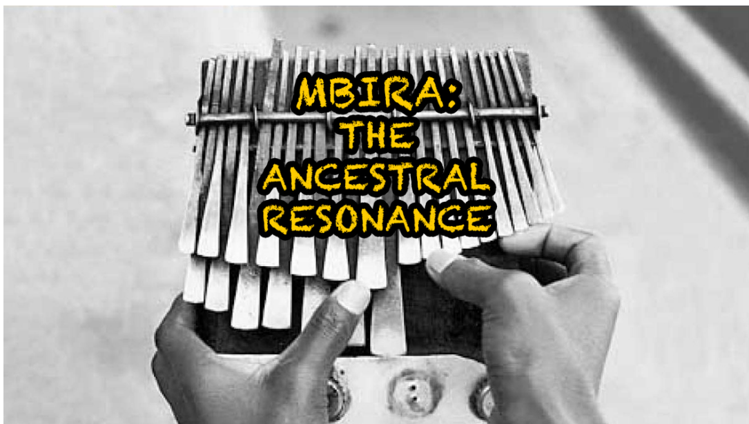
Poster image: Album cover of Africa: Shona Mbira Music , featuring mbira ensemble Mhuri yekwaRwizi , recorded by Paul Berliner .