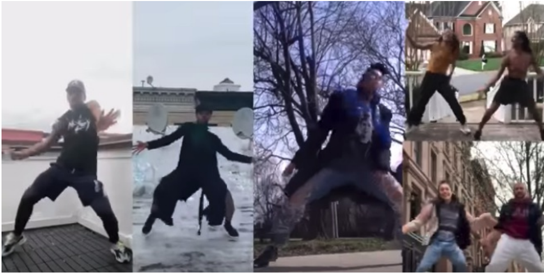
Still from compilation video of Alvin Ailey dancers.

Follow RU on Facebook , Instagram and Twitter for updates, opportunities, RU Community news, and resources @residencyunlimited.