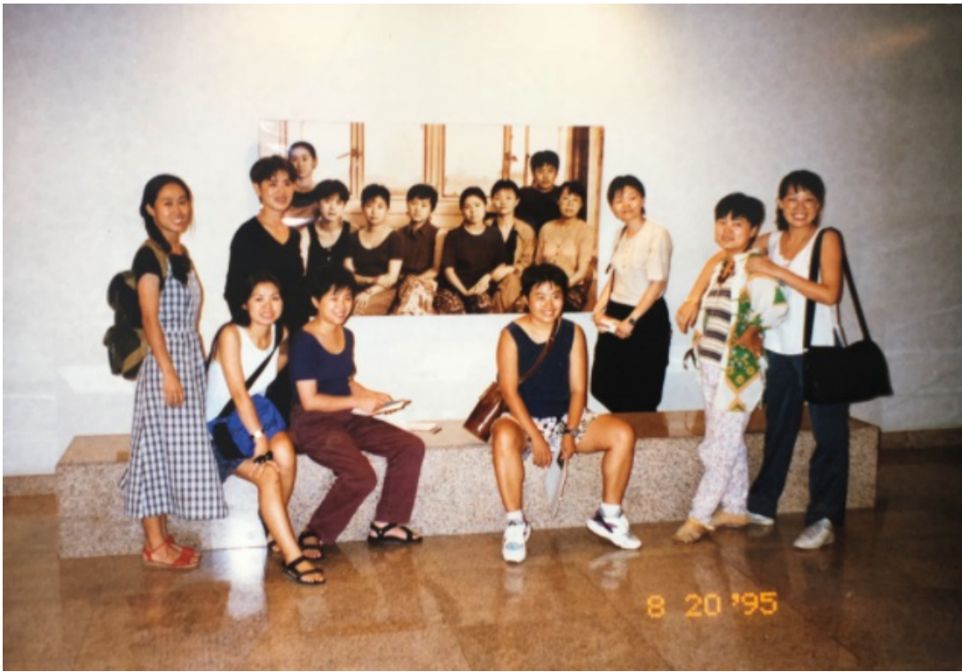
The World of Female Painters, second iteration, 1995. Courtesy of Yu Hong.