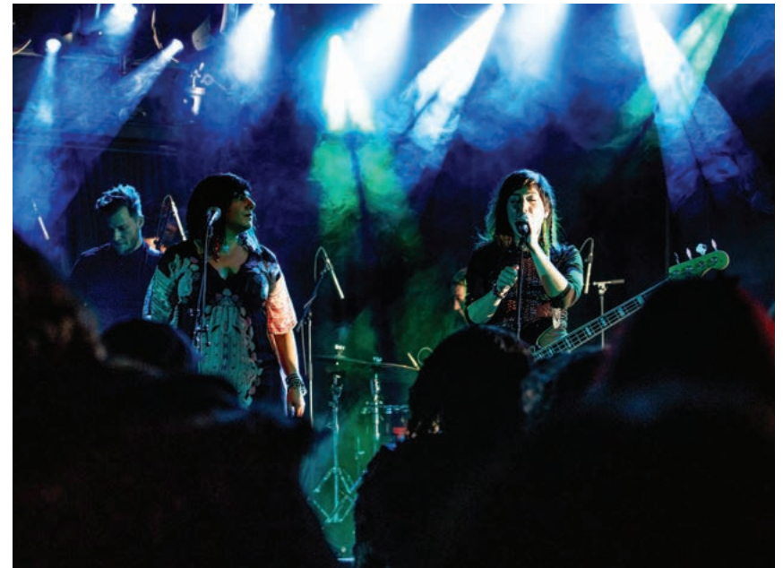
Artists: ABJEEZ / Photo credit: Jonathan McPhail Photography

In Iran, the legal code is based on both Islamic and civil law. Under these laws, it is illegal for a woman to sing in front of mixed-gender audiences. As such, many female Iranian musicians have been forced into exile simply because they pursued careers in music. In Russia, an amendment to existing child protection laws criminalizes what is referred to as “gay propaganda.” Under this amendment, artists who make work that openly explores issues of sexual orientation and gender identity are at risk of arrest and imprisonment by the government. One artist from Russia who identifies