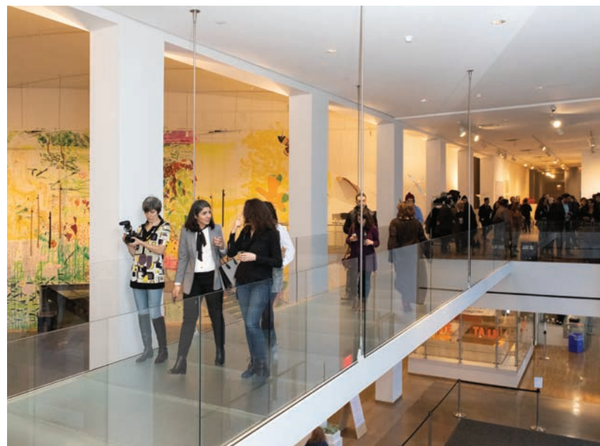
Artistic Freedom Initiative exhibition at Queens Museum, titled Executive (Dis)Order: Art, Displacement & the Ban .

Lastly, when coordinating relocation of an at-risk artist, it is important to consider not only the political climate of the individual's home country, but that of the hosting site's country as well. For example, over the last several years, the political climate in the United States has become increasingly anti-immigrant, and nationalist movements around the world continue to gain momentum. In the United States, an artist can face increased difficulty securing visa or petition approval, and obstacles when attempting to expedite their entry into the United States. When evaluating available options for relocation in each artist's case, these factors must be considered and addressed accordingly.