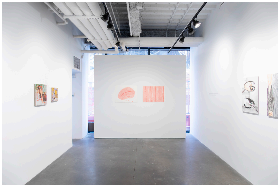
Installation View of In distinction from the material world.

88 Essex Street, New York, 10002 August 2 - September 1, 2019