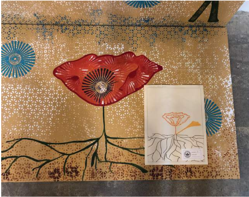
Some of the drawings done by students shown side by side with the final work.