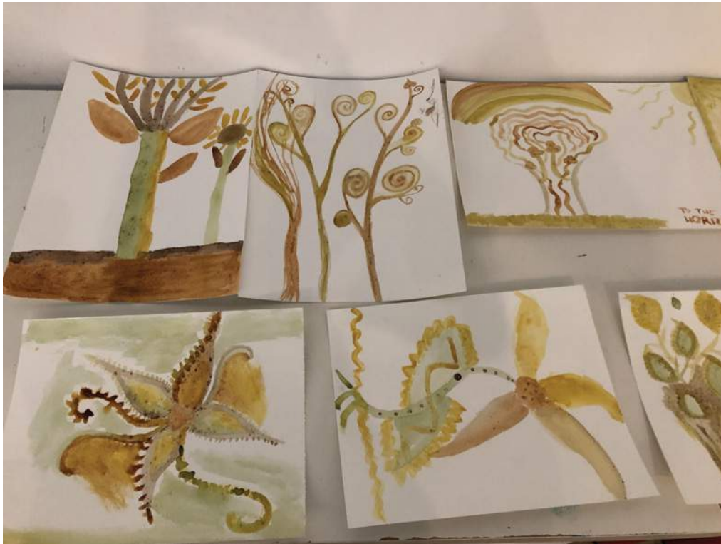
Drawings done by students during the workshop using watercolors made from natural pigments.

Led by Ana Ratner from Herban Cura the theme of the second workshop was: HOW TO CREATE THE NATURAL COLORS FROM PLANTS AND PAINTING IMAGINARY PLANTS. Herban Cura challenges urban disconnect by providing inclusive spaces of healing, learning, and collaboration. By starting from the assumption that in natural systems there is no waste, Herban Cura observes an inherent integrity present in Nature. The artists taught the students how to extract natural pigments from local and immigrant plants, and non-native ones. They then made watercolors with these natural pigments.