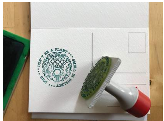
Stamp created by the artist inspired by art nouveau decoration seen above.