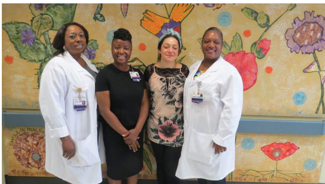
Presentation of the mural at Kings County Hospital, June 25th 2019.