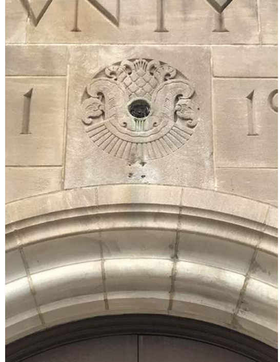
Art Nouveau decoration at King County Hospital Center's historical old entrance.