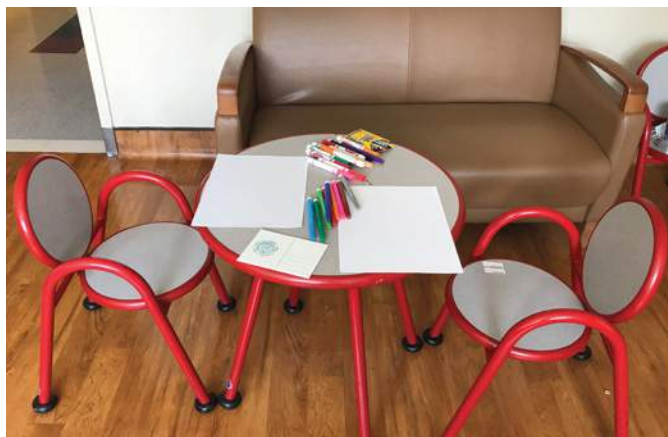
Workshop with hospitalized children at Kings County Hospital Center's pediatric unit.