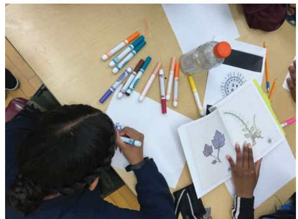
Student working on a drawing during the workshop.

The first workshop took place in Wingate High School and was dedicated to the observation of landscape. The theme was: WHAT ARE IMAGINARY PLANTS? HOW WE CAN CREATE THEM? Anne Percoco presented her herbarium project Parallel Botany (The Study of Imaginary Plants) that contains over 90 imaginary plants. Students were then invited to design their own imaginary plants and collectively create visual elements for a new herbarium. Their proposals (drawings and texts) were then incorporated into the mural.