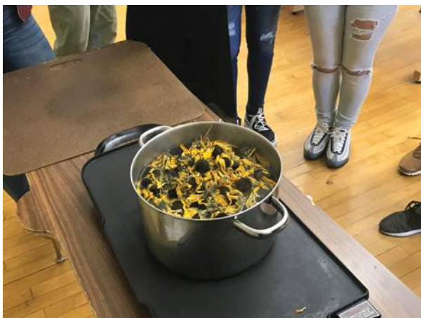
Students participate in the extraction of natural pigments later used to make watercolors and silk dye.

Led by Ana Ratner from Herban Cura the theme of the second workshop was: HOW TO CREATE THE NATURAL COLORS FROM PLANTS AND PAINTING IMAGINARY PLANTS. Herban Cura challenges urban disconnect by providing inclusive spaces of healing, learning, and collaboration. By starting from the assumption that in natural systems there is no waste, Herban Cura observes an inherent integrity present in Nature. The artists taught the students how to extract natural pigments from local and immigrant plants, and non-native ones. They then made watercolors with these natural pigments.