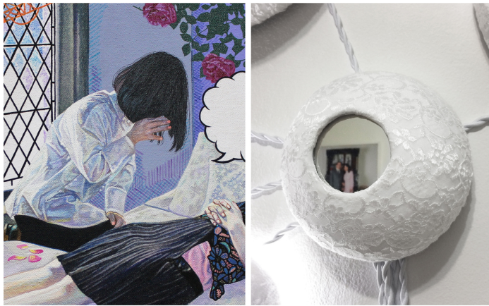
Naomi Okubo: Let me tell you something... Series of Fairytale , 2019. Acrylic on Cotton / Wood, Plexiglass-mirror, Metallic-chain.

March 5 - 11 at 866 E 48th St, UN Plaza.