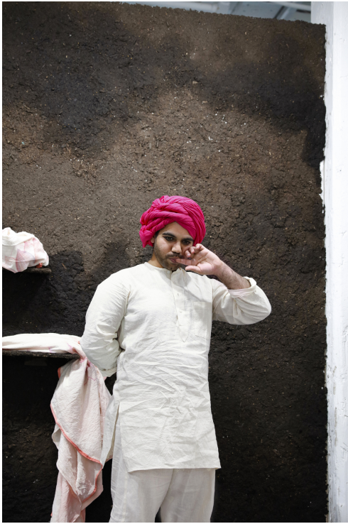
Kuldeep Singh, Architectonics of Dispersion