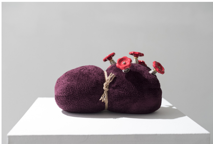
Martin Penev, Everything is Fine With Me , 2018. Object, textiles, rope, valves