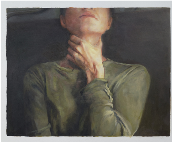
Regina Parra: But truly I do fear it, 2018. Oil on paper

Aug 11, 12pm at Ace Hotel Lobby. Spots very limited. RSVP here