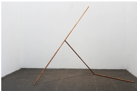
Karian Amaya: montaña, 2018. Copper