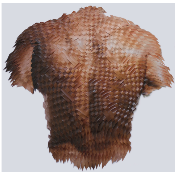
Jorge Otero: Skin, 2017, Digital print on handwoven leather, 130x135 cm