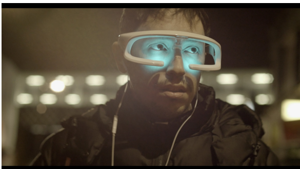
Martin Kohout, Slides, 2017 (still). HD Video, sound, color; 22:30 min.