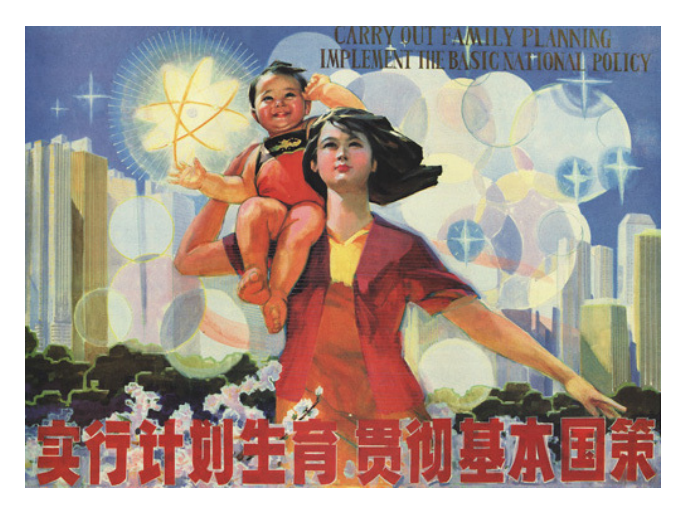
Carry out family planning, implement the basic national policy, 1986, poster, 53x77 cm, designer: Zhou Yuwei (周玉玮)